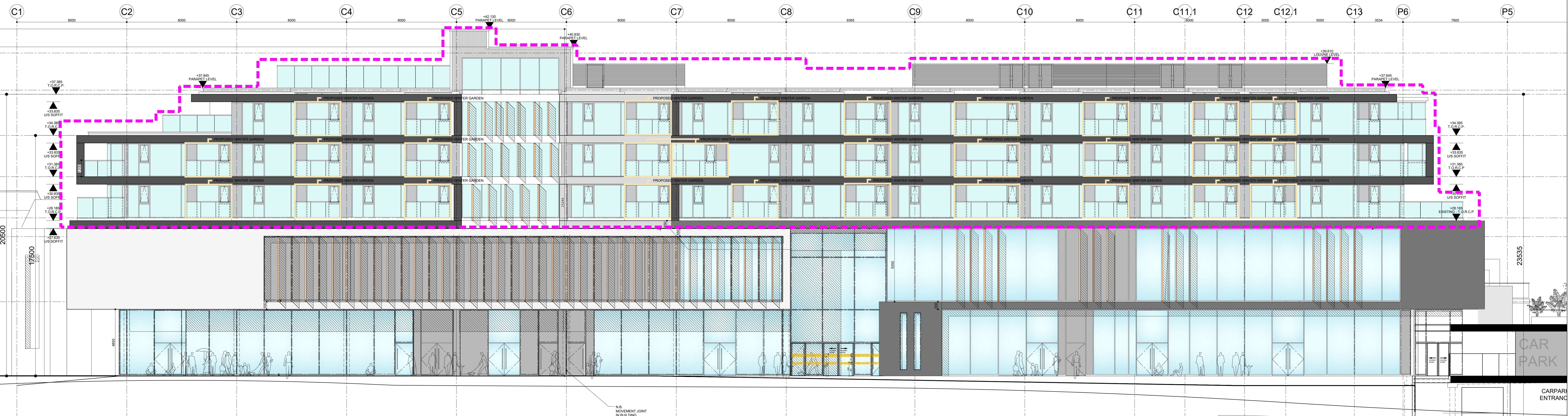
2 PROPOSED NORTH EAST ELEVATION A0 @ SCALE: 1:100